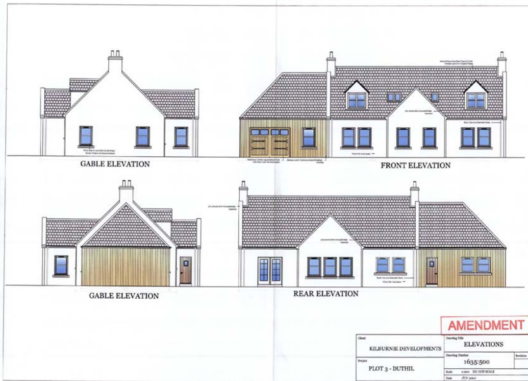
Fig. 7. Plot 3 Elevations