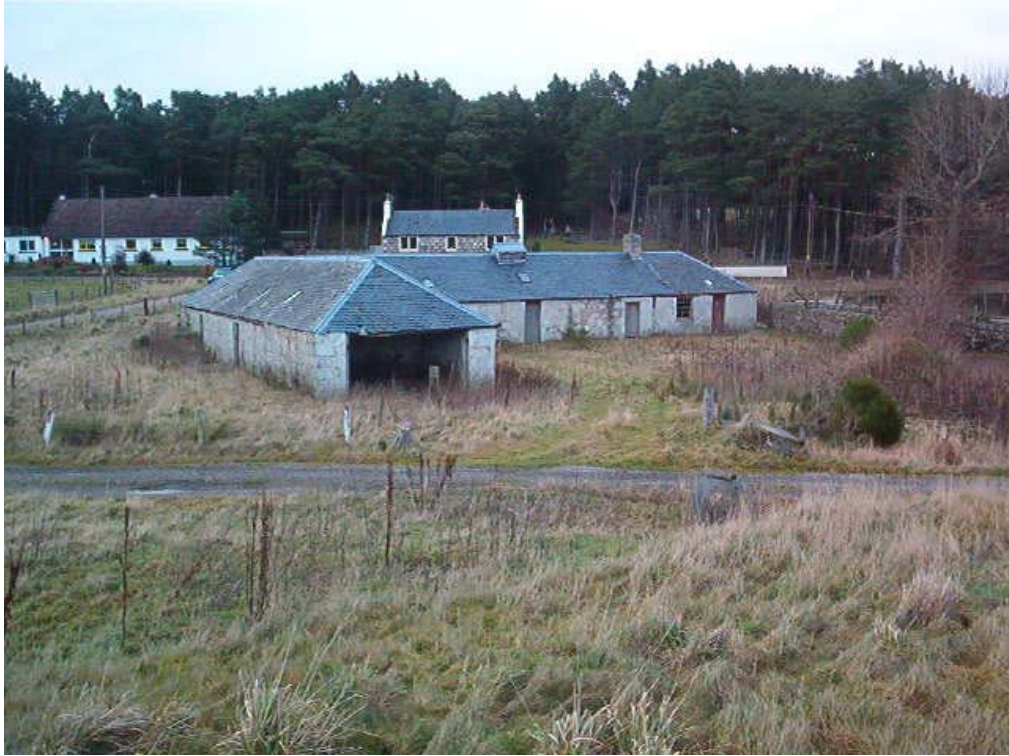
Fig. 3. Site and steading looking northwards