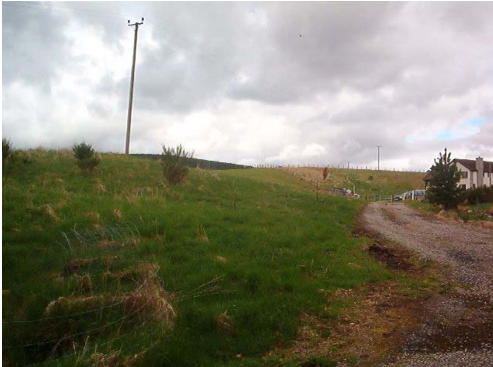
Fig. 4. Southern sloping part of site and access track looking westwards towards “Braes of Duthil”

of houses to 3. This is the current proposal which is the subject of this report.