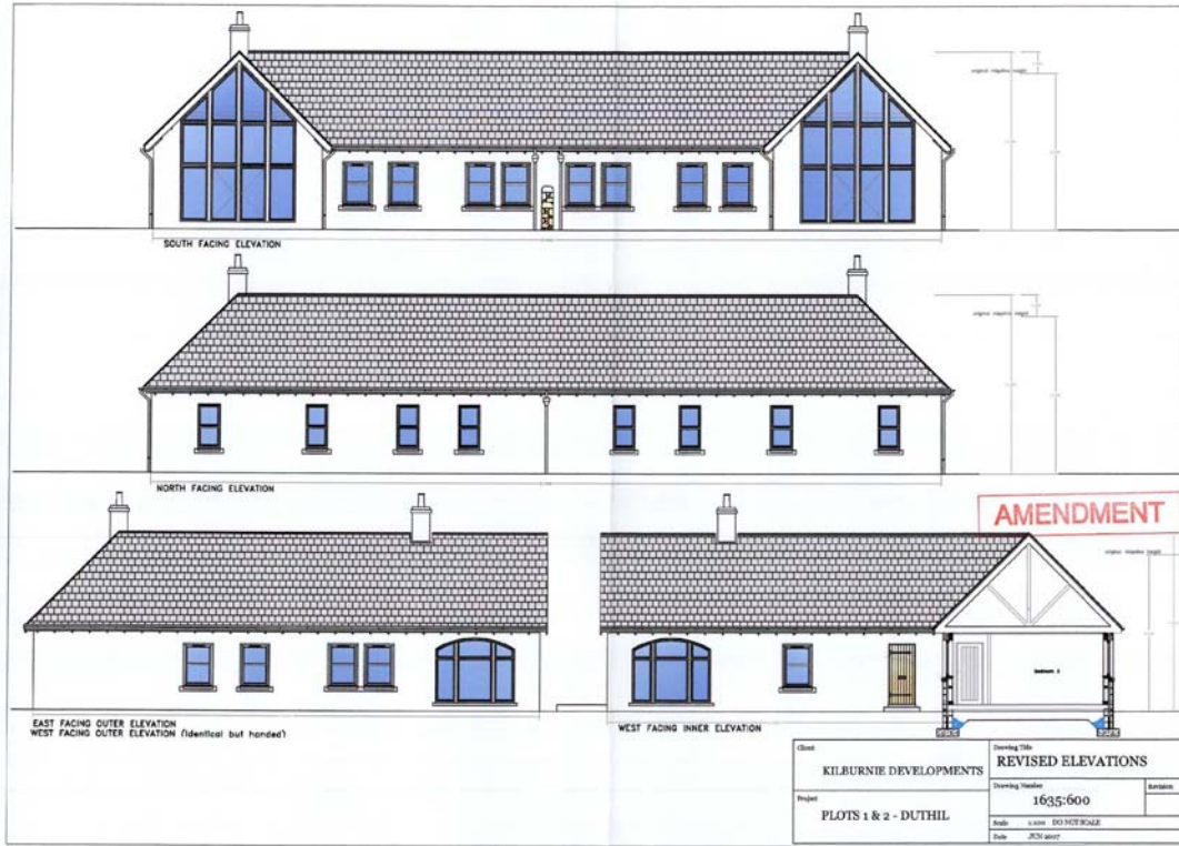
Fig. 6. Plots 1 & 2 Elevations (“U”-Shaped Building)