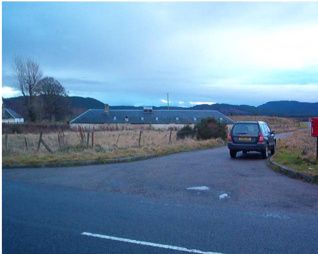
Fig. 2. Site and steading viewed from the A938 looking south